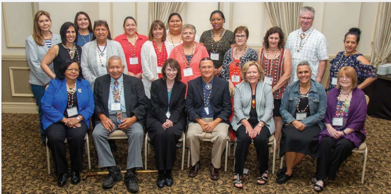
Indigenous nursing researchers and leaders from Australia, Canada, Panama, and Peru, as well as Native Americans, Alaska Natives, and Native Hawaiians gathered at the summit.