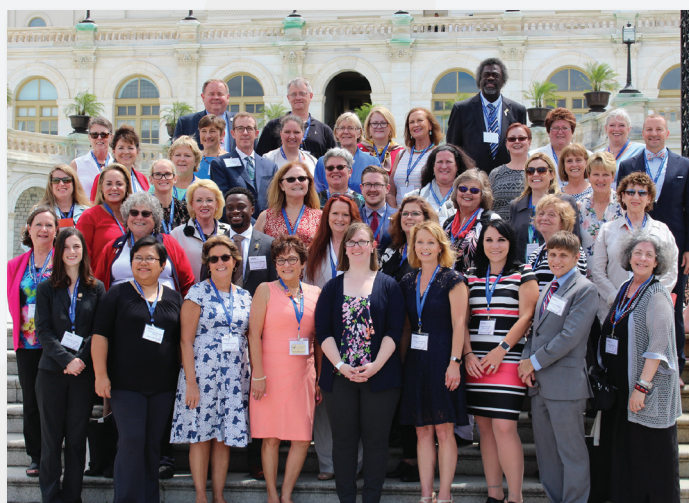
Participating in ANA's Annual Hill Day is a powerful way to have nurses' expertise and perspectives heard.

ANA strives to ensure that nurses, America's most honest and ethical profession for the past 17 years, have a seat at the table when it comes to these critical issues. Through legislative efforts in 2019, ANA will continue to put the patient and consumer first and will elevate the role of nursing in America's healthcare system.