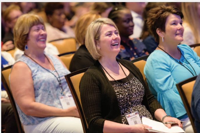
Nurses gathered for entertaining and informative sessions at ANA and ANCC co-located conferences in Orlando.

While one speaker encouraged nurses to find their “inner spark,” the energy among nurses was already palpable as they came together to learn, share, network, and celebrate at two recent conferences held by the American Nurses Association (ANA) and the American Nurses Credentialing Center (ANCC) in Orlando, Florida.