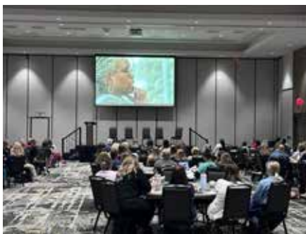
The video documentary Everybody's Work moved the room

As the Nebraska Nurses Association looks ahead, the energy and engagement from this year's event reaffirm our shared commitment to championing nurses' voices and advancing the profession we all love. 🏡